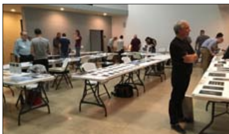
Member Print Share & Social