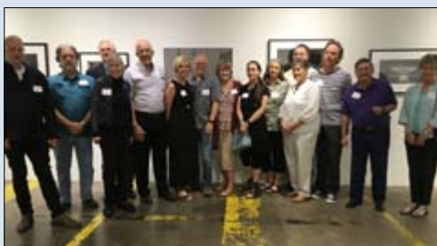
30th Anniversary Members' Only Show reception