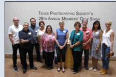
MOS 29 artists and TPS Executive Director at opening